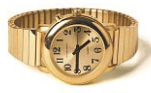
Talking watch for the blind